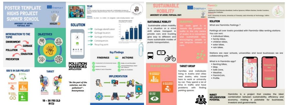
Selected posters of the students' teams

The intensive 7-day school finished with the final presentation session. The jury selected the best solution... However, it was not an easy task. Each team did its best!