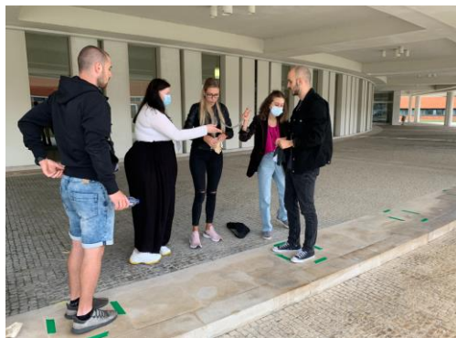
Water transportation challenge