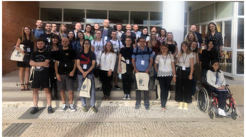
Curious participants of International Summer School in Aveiro, 1 st day.

Those curious students looking for some challenges were supported by High5 mentors – 11 academic teachers from project consortium.